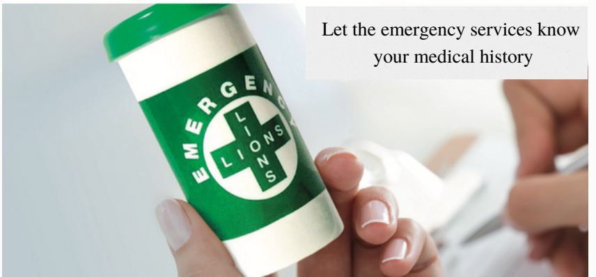
Pick up a bottle from Age Concern Epsom & Ewell