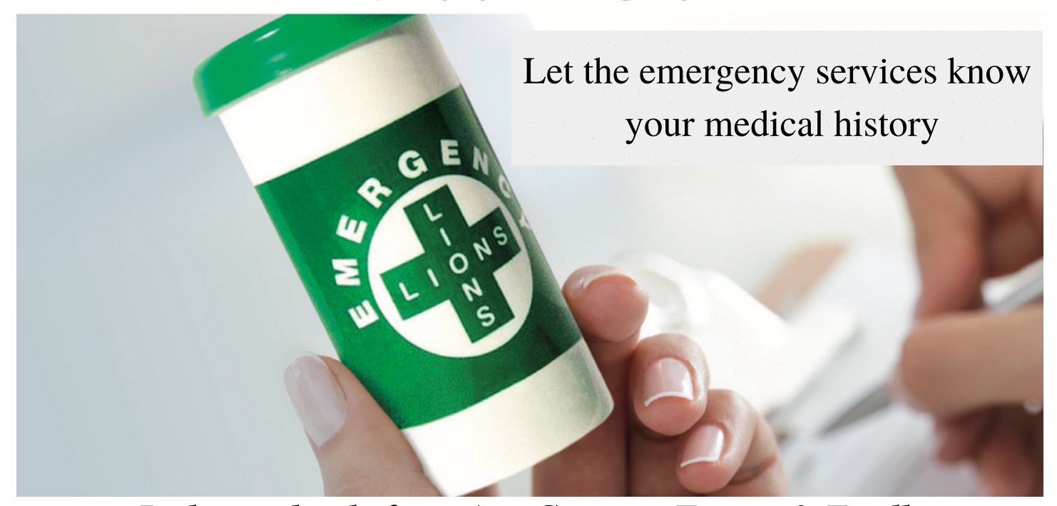
Pick up a bottle from Age Concern Epsom & Ewell

This scheme supplies FREE bottles to be kept in the fridge containing medical details that can be found quickly by the emergency services