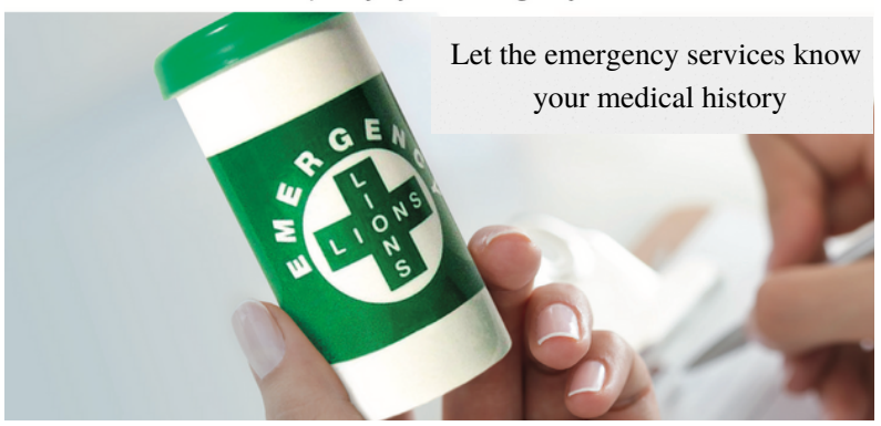
Pick up a bottle from Age Concern Epsom & Ewell

This scheme supplies FREE bottles to be kept in the fridge containing medical details that can be found quickly by the emergency services